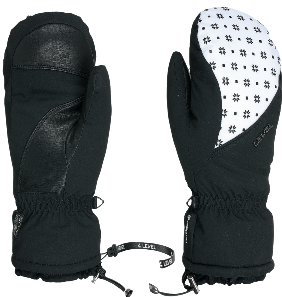
35 black white