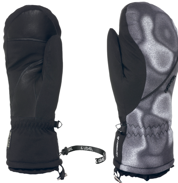
26 black camo